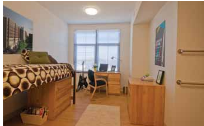
Special connections were created at the precast concrete slab edges to conceal ties so they wouldn't show on the slabs' underside, allowing the slab to serve as the finished ceiling without any disruptions.

Precast Components: 380 architectural panels