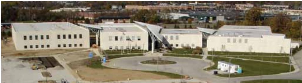
Phase 1 of the Ivy Tech project consisted of constructing three rectangular buildings clad with architectural precast concrete panels. Phase 2 added onto two of the structures by removing some of the panels and adding length. It also included a fourth building.

Precast Components: 166 architectural panels in Phase 1, 143 vertical wall panels in Phase 2