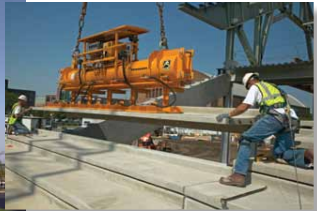
A specialized vacuum-clamp lifting device allowed the large structural seating components to more easily be transported and rotated as needed throughout the construction process.