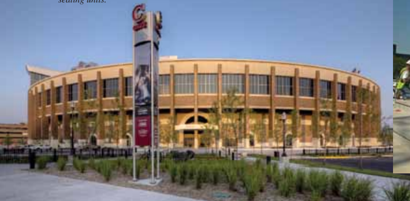
The new TCF Bank Stadium at the University of Minnesota in Minneapolis features a façade and colonnade columns clad with architectural precast concrete panels, as well as seating elements created with precast concrete components, including raker beams and seating units.