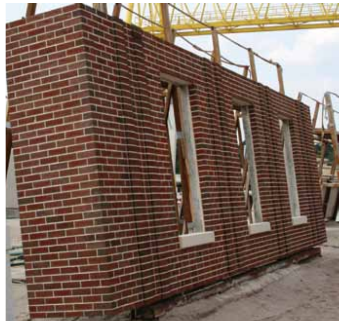
The large size of the panels minimized the number of joints, while casting 3-foot return legs with thin brick on both sides of the punched window units provided a traditional running-bond appearance.