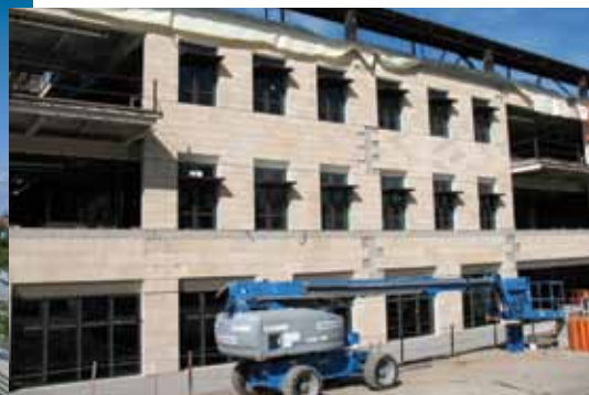
Panels were cast without full-sized stones joint overlaps to avoid creating noticeable vertical joints. Once the panels were erected, crews handset the missing stones to cover the joints.