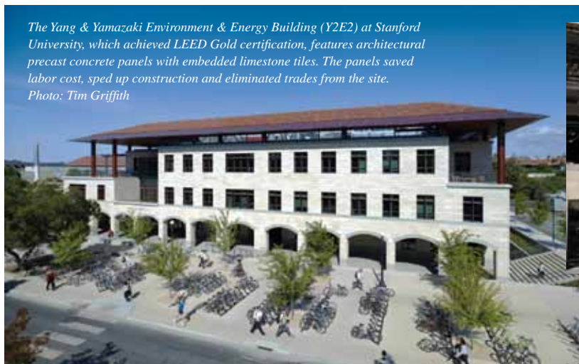
The Yang & Yamazaki Environment & Energy Building (Y2E2) at Stanford University, which achieved LEED Gold certification, features architectural precast concrete panels with embedded limestone tiles. The panels saved labor cost, sped up construction and eliminated trades from the site.