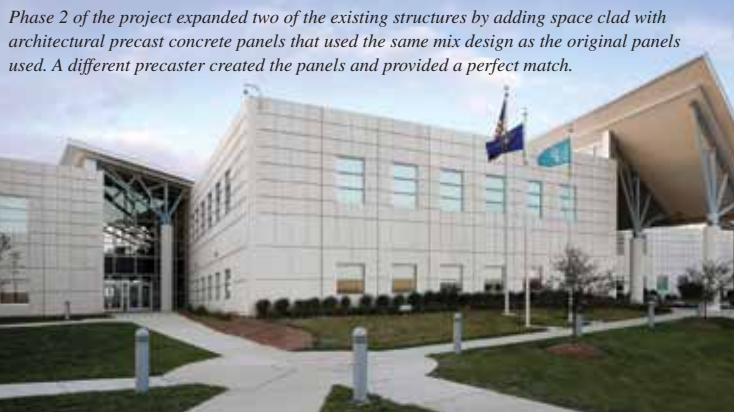
Phase 2 of the project expanded two of the existing structures by adding space clad with architectural precast concrete panels that used the same mix design as the original panels used. A different precaster created the panels and provided a perfect match.