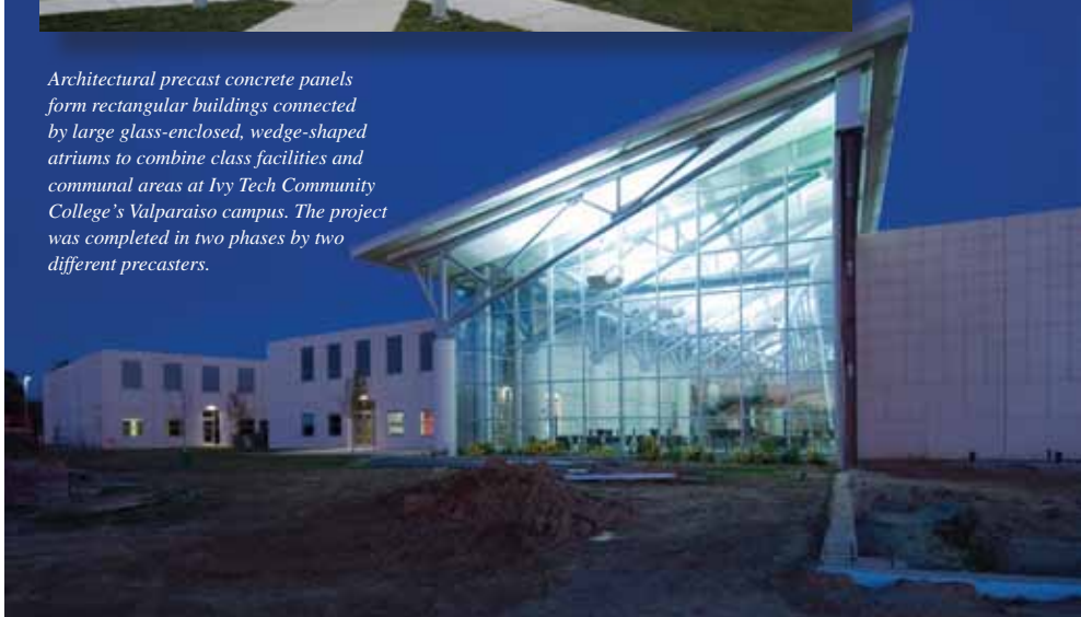
Architectural precast concrete panels form rectangular buildings connected by large glass-enclosed, wedge-shaped atriums to combine class facilities and communal areas at Ivy Tech Community College's Valparaiso campus. The project was completed in two phases by two different precasters.